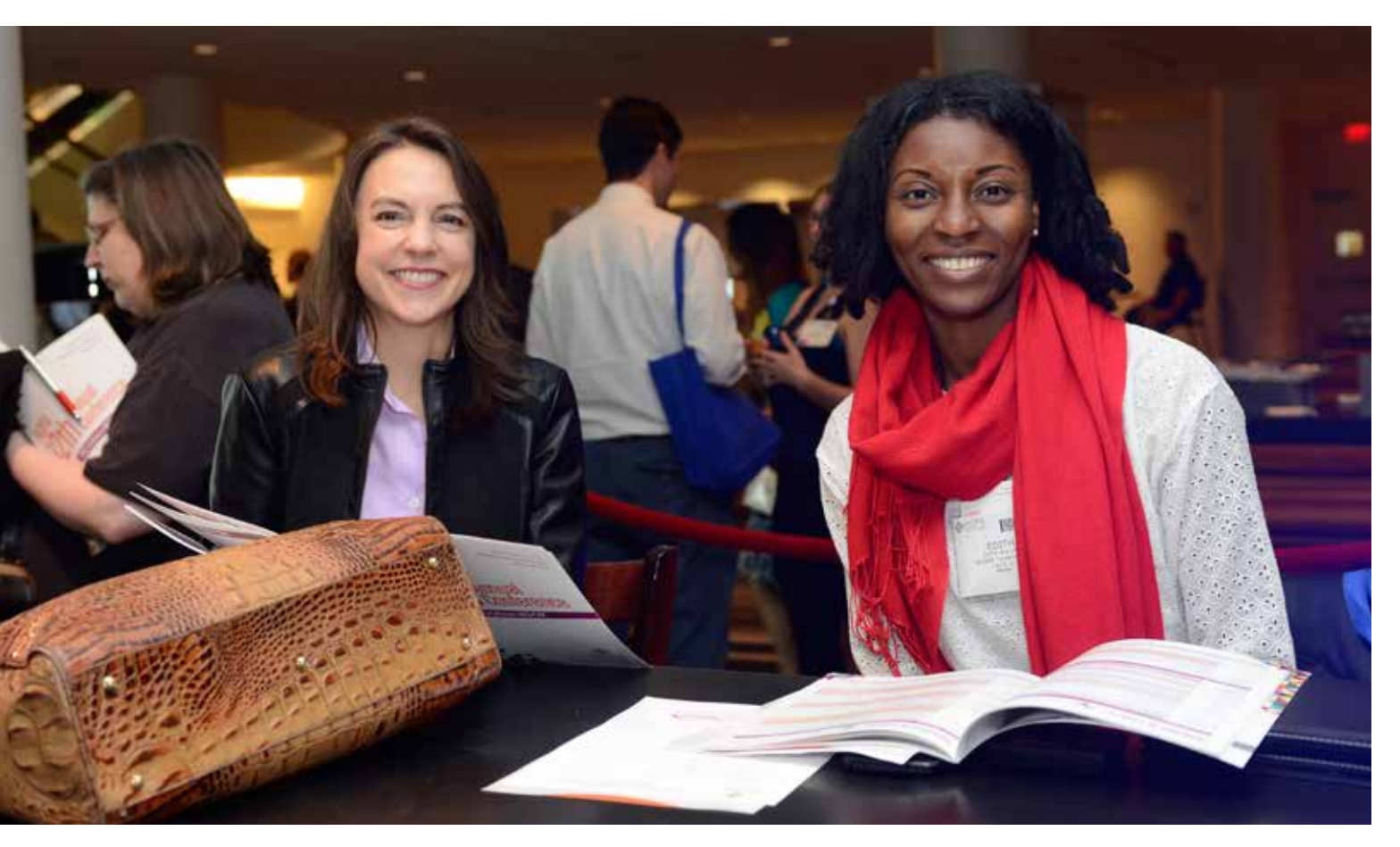
The Attendee Lounge provided a great place for networking.