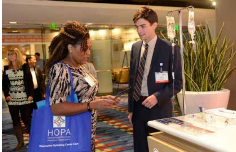
Exhibitors and attendees spend quality time together in the Exhibit Hall.