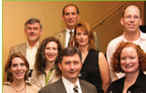
HOPA 2007-2008 Board

Historically – and perhaps that is a relatively short history for HOPA – the obvious mechanism for members to participate in HOPA is via committee work. In an attempt to increase the opportunities for committee work for all members, we are currently finalizing guidelines to help committee chairs and vice-chairs increase the breadth and depth of committee memberships. Hopefully, you have received the survey recently sent to all members asking about your experiences and interests in being